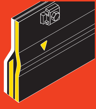
Kombi S50 Wave